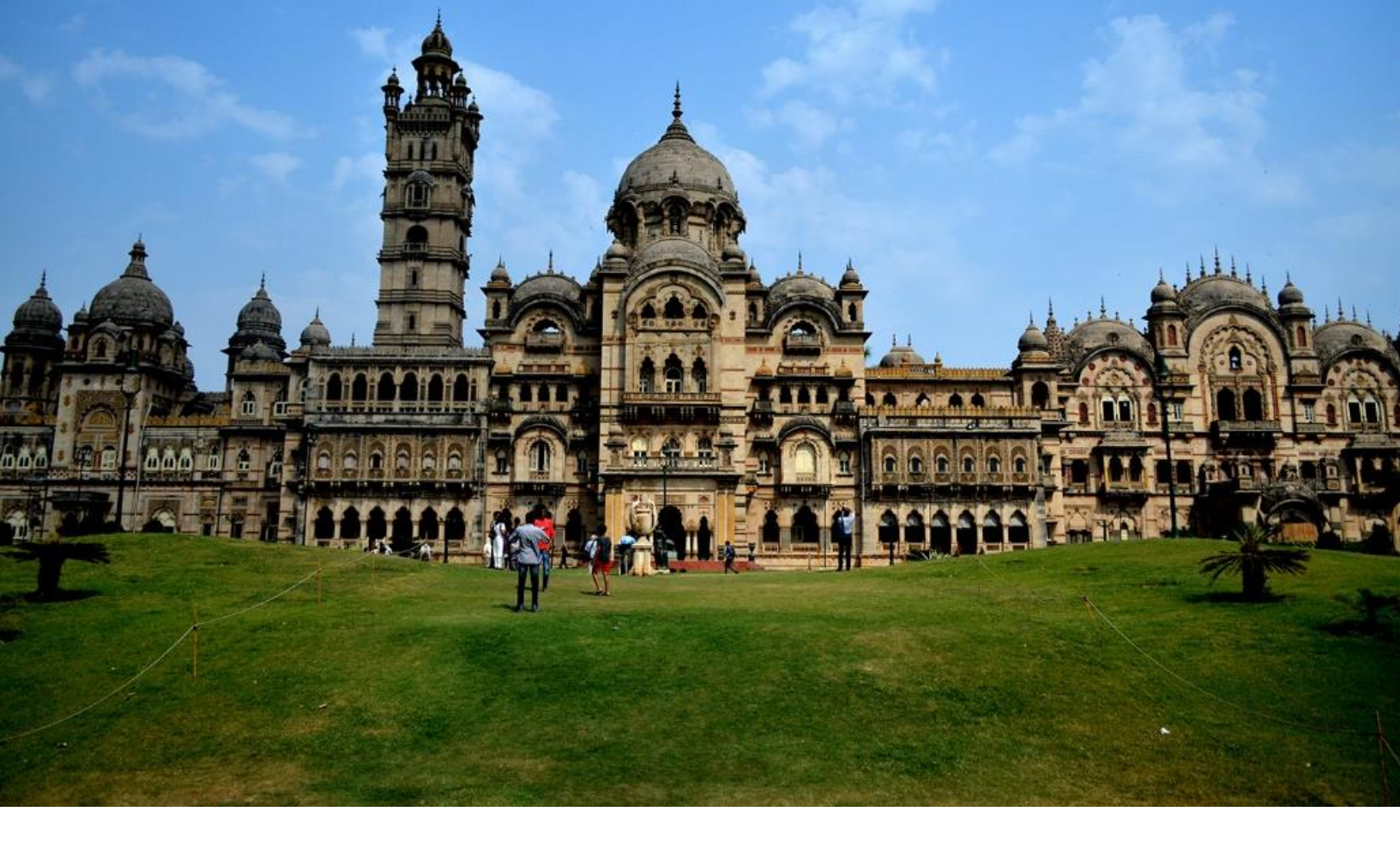
Day 07 - AHMEDABAD TO VADODARA [120 KMS / 2 1/2 HRS APPROX] "Breakfast"

Morning after breakfast drive for Vadodara and do sightseeing of Vadodara as follows