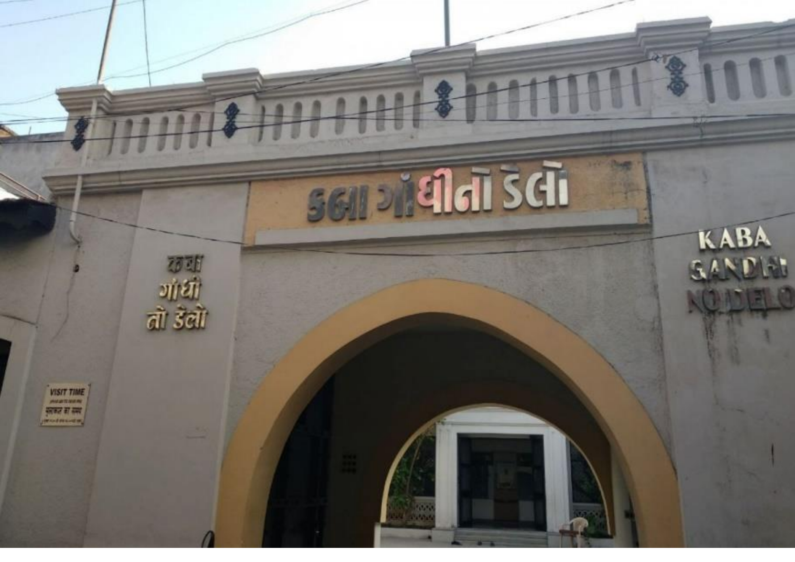
Day 03 - PORBANDAR TO RAJKOT [185 KMS / 5 HRS APPROX] "Breakfast"

Morning after breakfast we drive for Rajkot, upon arrival transfer to hotel.