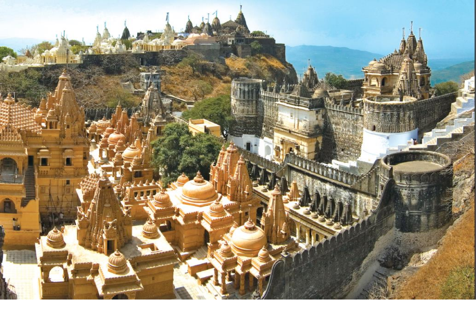
Day 05 - BHAVNAGAR - PALITANA - LOTHAL - AHMEDABAD [285 KMS / 6 HRS Apx]

Morning after breakfast drive for visit Palitana The Shatrunjaya Hill is located at a height of 591 metres. The Shatrunjaya Temple is the most sacred temple of the Jains and one of the largest of its kind in India. One has to climb up the hill for about 4 kms (600 meters) on a stepped path to Shatrunjaya (place of victory over worldliness). You can reach this place either in Doli or lift chairs or by walking.