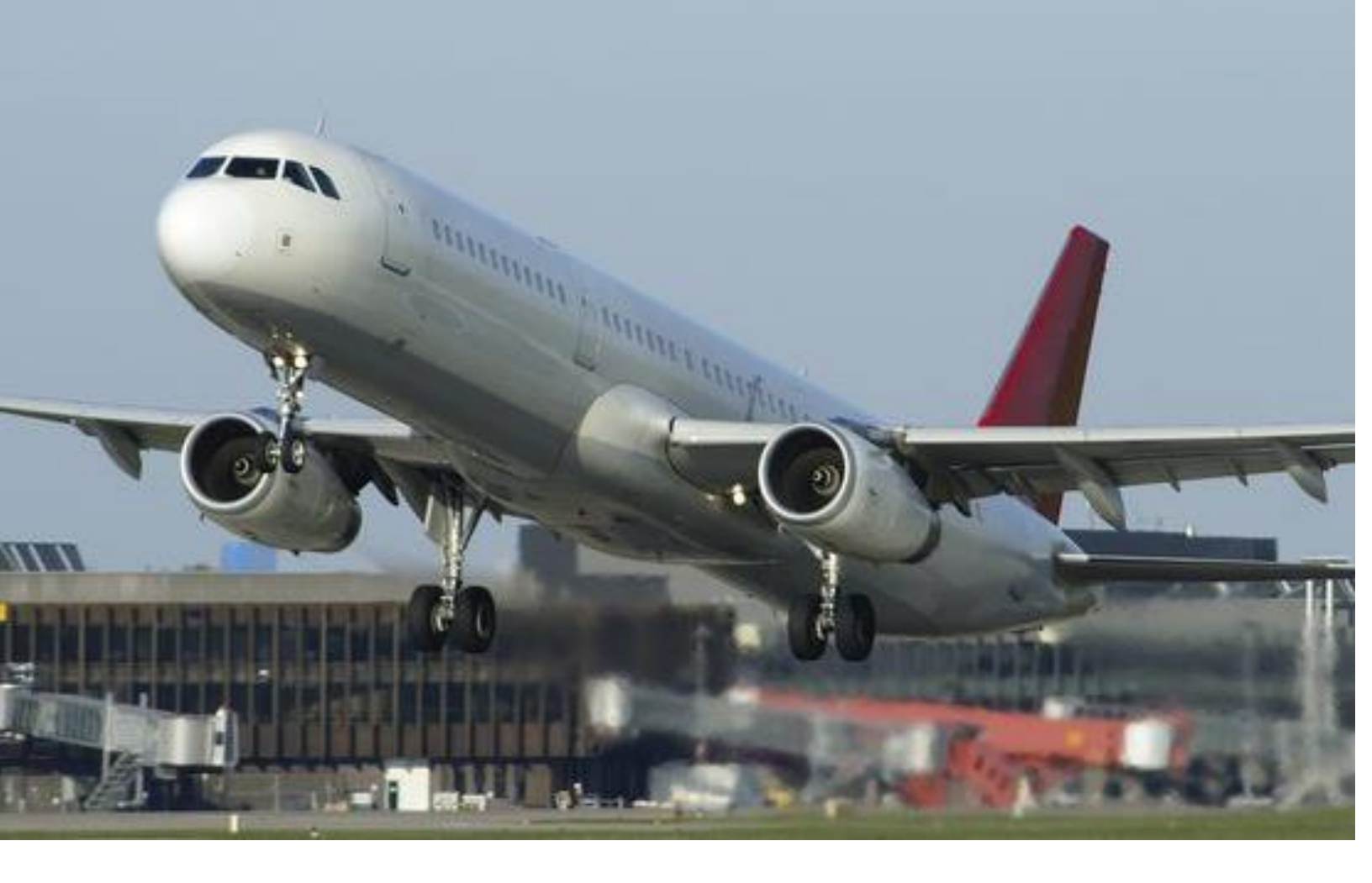
Day 12 –DEPART DELHI "Breakfast"

Etd: as per your Flight details, we transfer you to Delhi International Airport for flight back home.