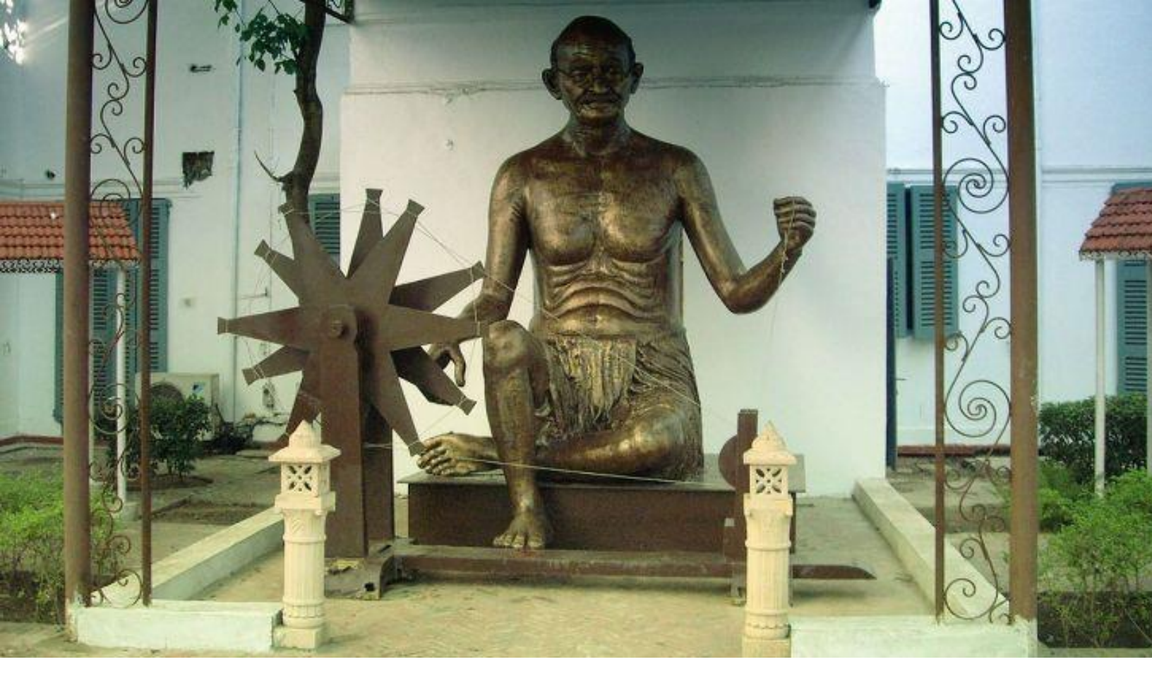
Day 04: RAJKOT – BHAVNAGAR [190 KMS / 5 HRS APPROX] "Breakfast"

Morning after breakfast drive for Bhavnagar and transfer to hotel.