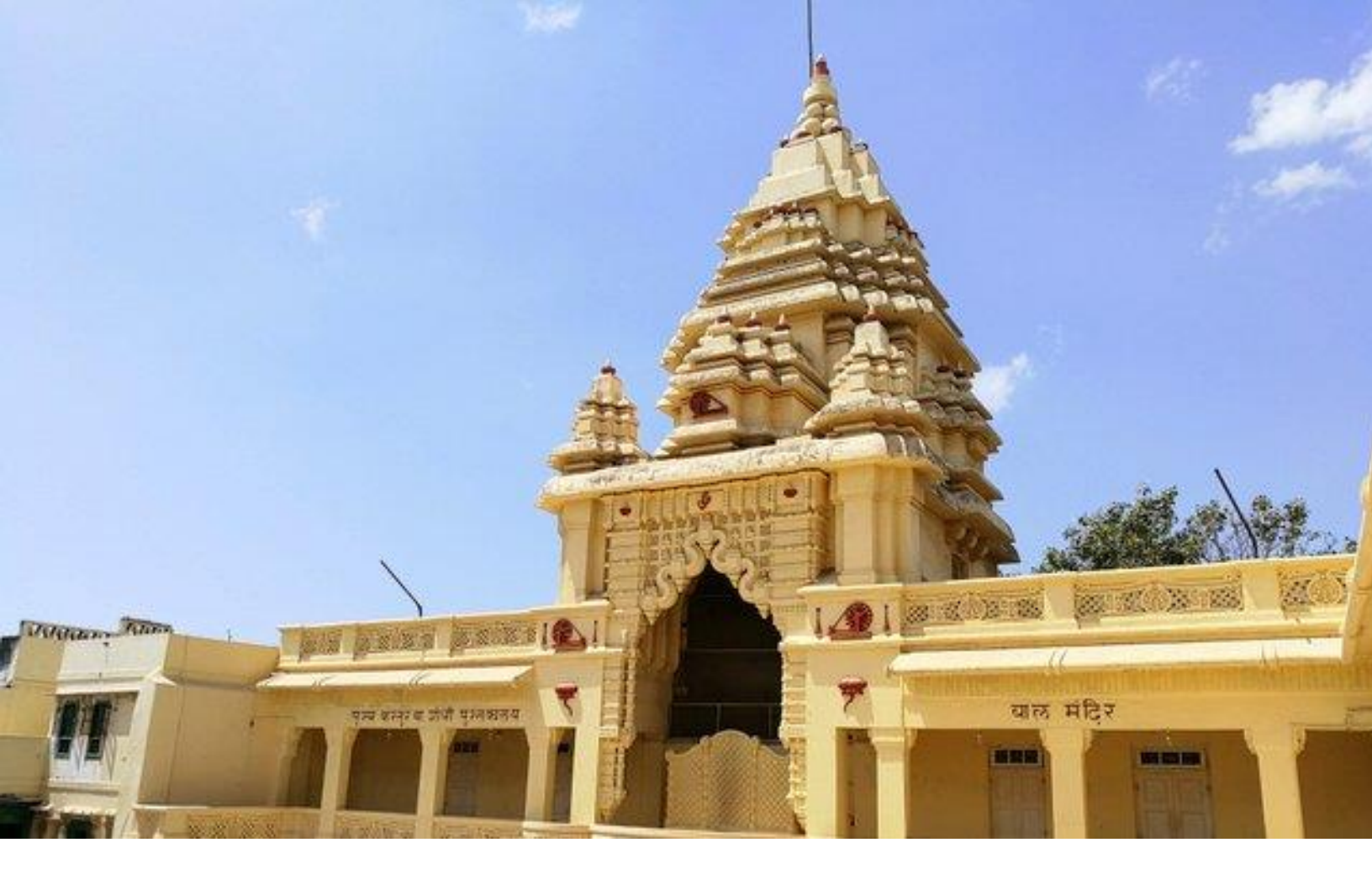
Day 02 - Mumbai / Porbandar "Breakfast"

Early morning we transfer to Mumbai Airport to connect Flight to Porbandar .